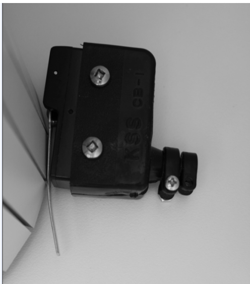
Your micro switch when the power sockets are activated